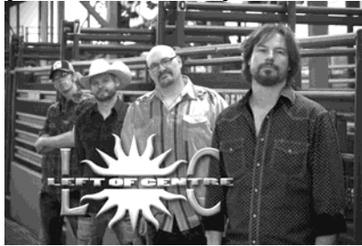
Left of Centre

YREKA – Pepsi Bottling of Mt. Shasta, The Red Scarf Society, The Miners Inn Best Western and the Siskiyou Golden Fair have shook it up and are excited to announce a great music mania line up for the “Pioneer Days to Modern Ways” run of the 2017 Siskiyou Golden Fair!